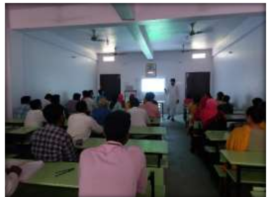
Assistance to slow learner in ICT Resource

Principal Maulana Mazharul Haque Teachers Training College Mathurapur, Samastipur