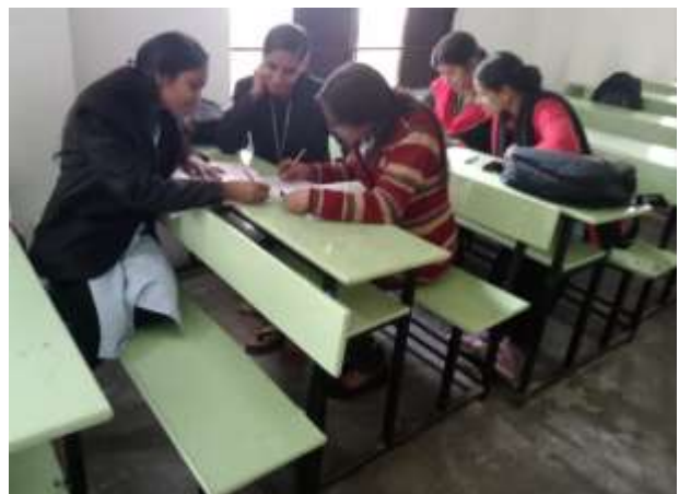
Group work to cater differential learning

Principal Maulana Mazharul Haque Teacher's Training College Mathurapur, Samastipur