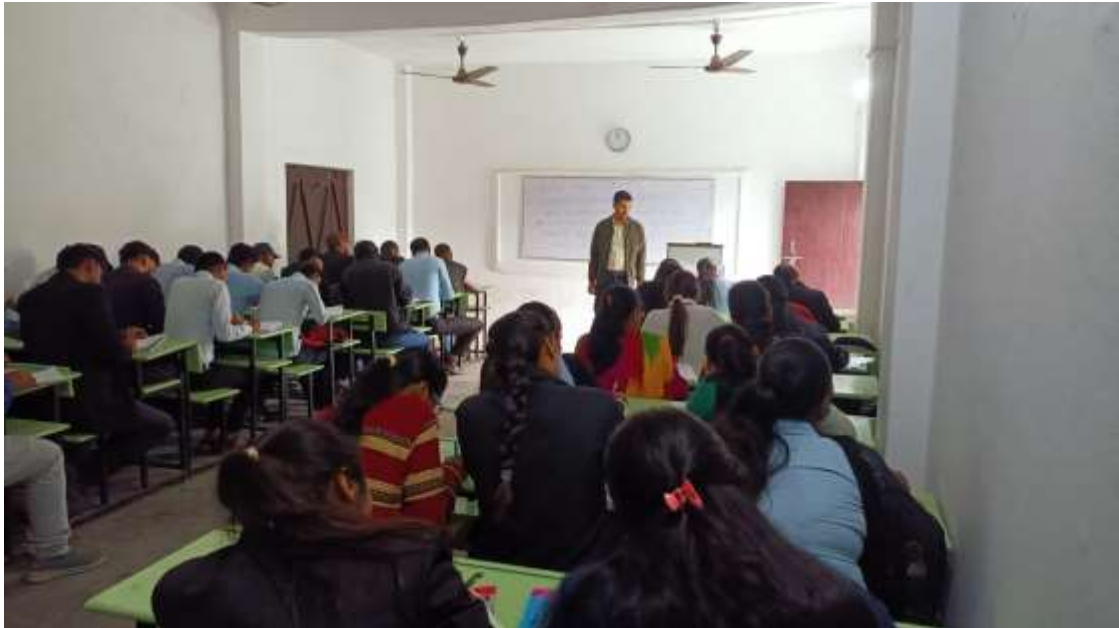
Teacher taking internal assessment of the students 28-02-2023